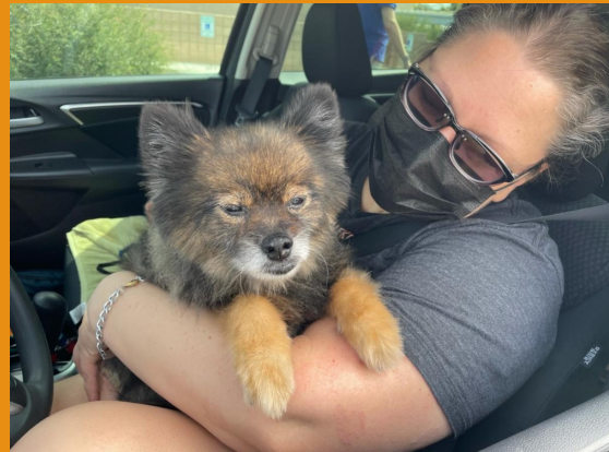
Ready to be blessed!