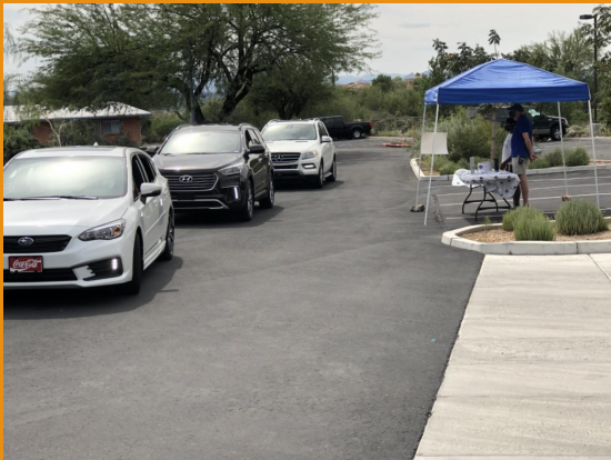
People waiting to have their pets blessed!