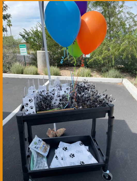
Treats and prizes await!