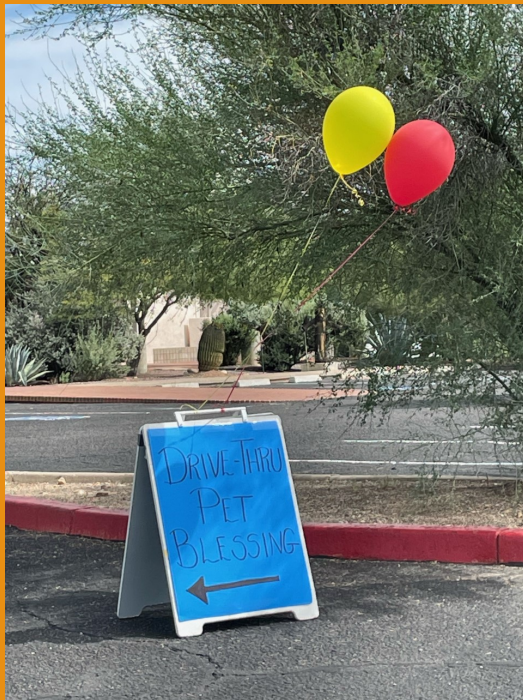
Welcome to the Drive-Thru Pet Blessing!